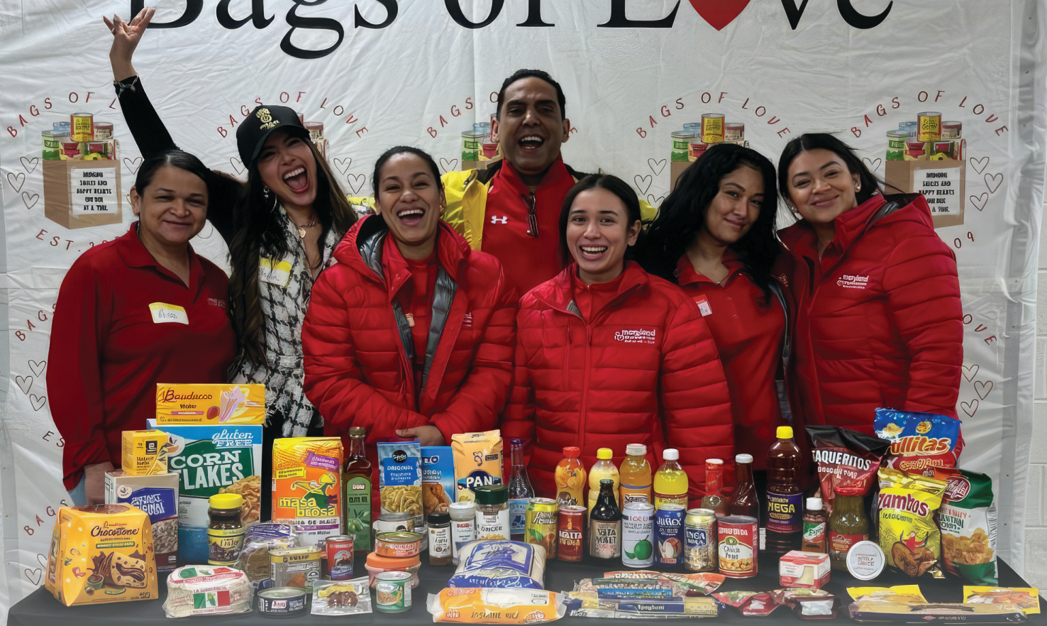
MPC Team Members work at the Bags of Love event, helping to package food.